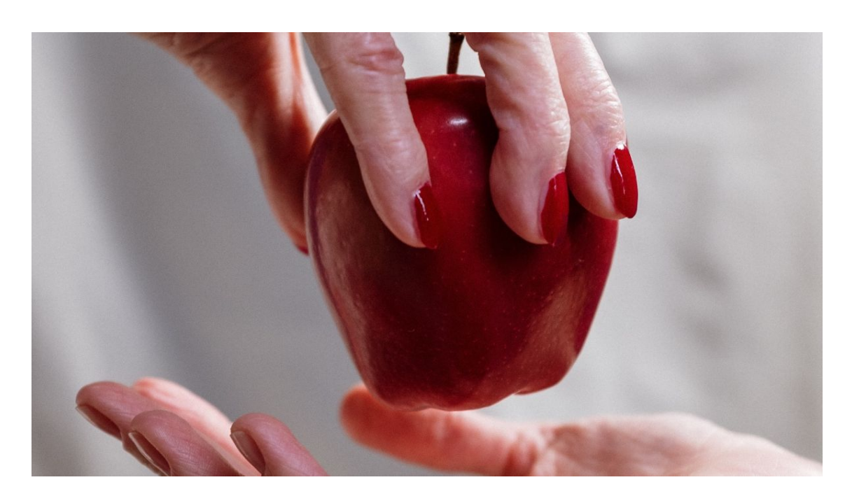
What AgeTech offerings do Apple, Amazon and others have, and what's ahead?